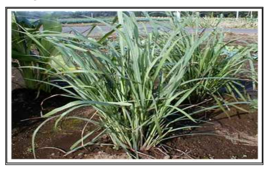
Figure No.3: Exomorpic feature of Lemongrass <sup>13</sup>